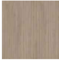
MA-NT Tabac Cherry