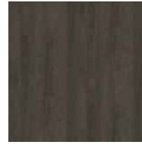
MA-NV Brown Hickory